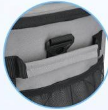
Reinforced Side Carrying Handles