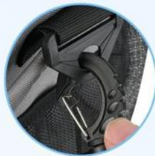
Detachable Shoulder Strap