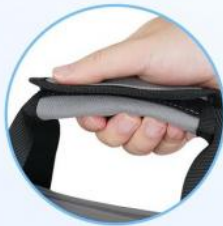
Reinforced Top Carrying Handles