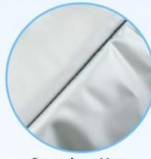
Seamless Hot Pressing