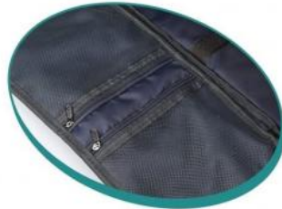
Cover storage bag