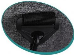
Shoulder belt buckle