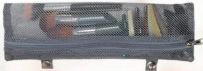
REMOVABLE STORAGE BAG