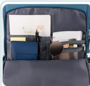
Front Accessory Pockets