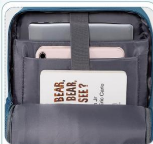
Laptop & iPad Compartment

Metallic locks and delicate sewing make for long wear.