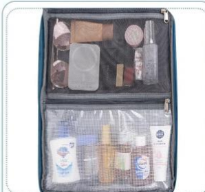
Wet & Dry Layers