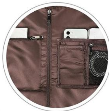
Various Internal Pockets