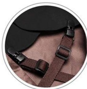
2 Fixing Buckles