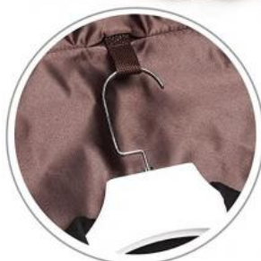
Hanging Suit Design