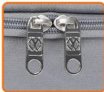
METAL DEBOSSED ZIPPER PULLER