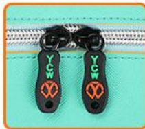
RUBBER ZIPPER PULLER