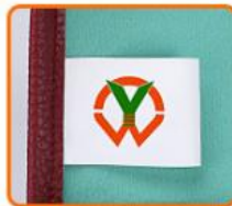
WASHING CARE LABEL