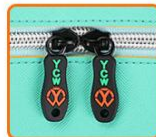
RUBBER ZIPPER PULLER