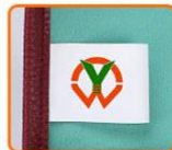
WASHING CARE LABEL