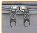
METAL DEBOSSED ZIPPER PULLER