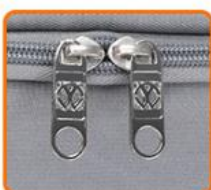
METAL DEBOSSED ZIPPER PULLER