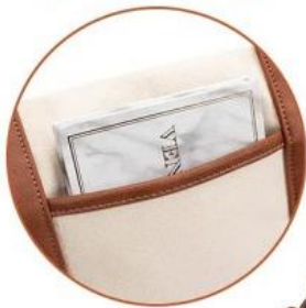
2.Inner Open Pockets