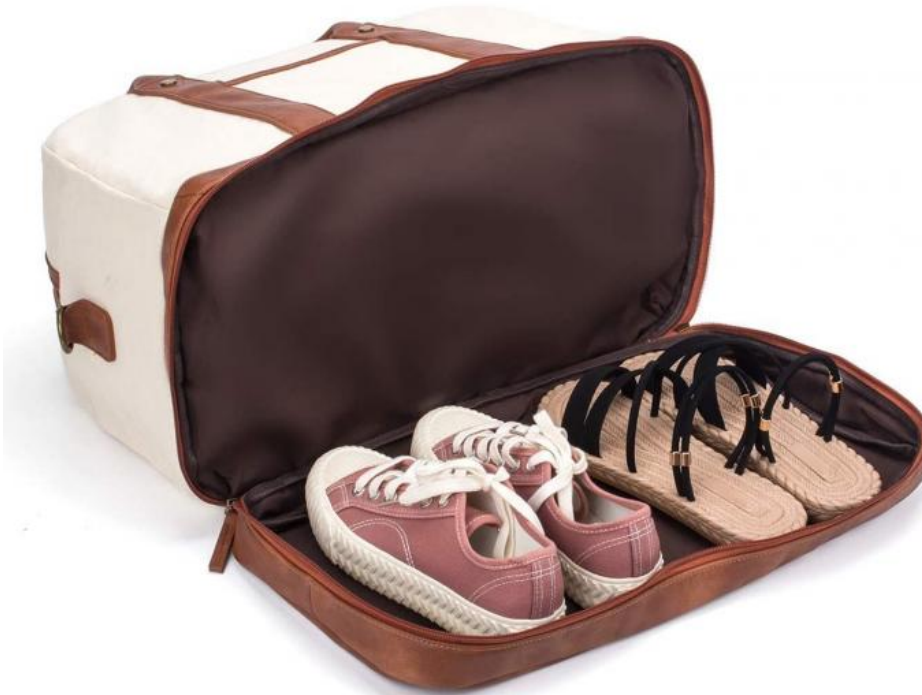
1. Waterproof Material